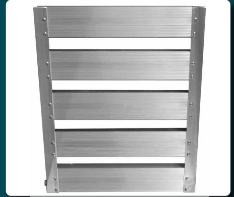
3 Slip-Resistant Platform