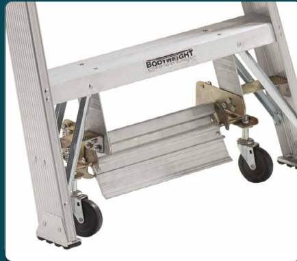
5 BODYWEIGHT™ ACTIVATED CASTER TECHNOLOGY PATENT PENDING