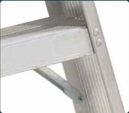
4 Heavy-Duty Gusset Bracing