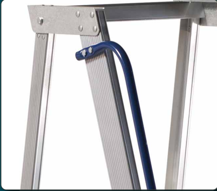
1 Top Rail Guard